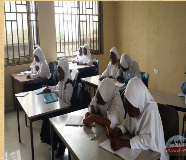
Classes in Progress