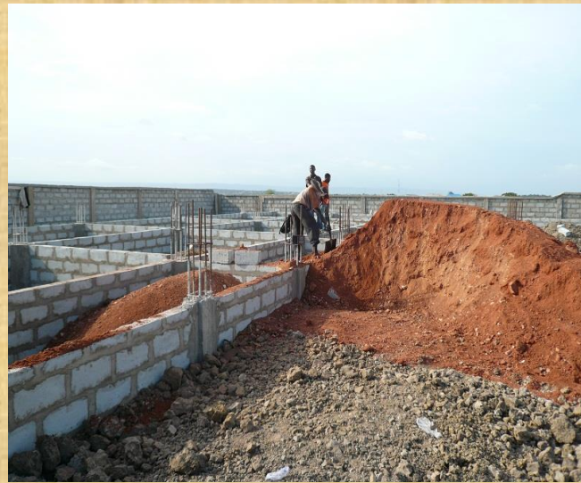
Ground Floor Construction