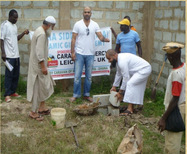
Laying the Foundations